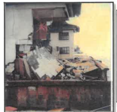
Hurricane Etana Damage 1985

To ensure against flooding, it is important to maintain the water-carrying capacity of the Town's drainage system, therefore--