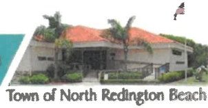
Town of North Redington Beach

190 - 173rd Avenue North Redington Beach, Florida 33708 Office: 727-391-4848