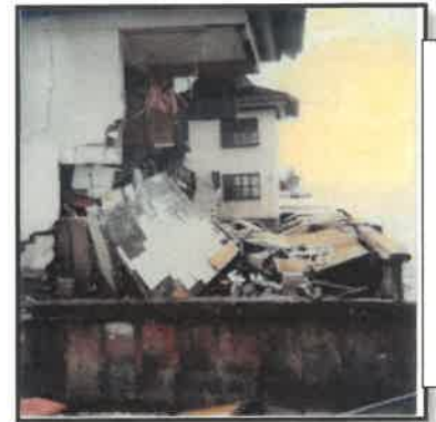
Hurricane Elena Damage 1985