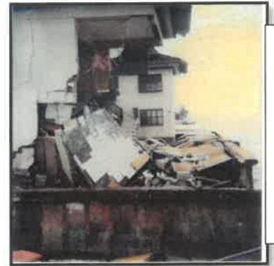
Hurricane Elena Damage 1985

Several of the Town's efforts to reduce flood damage depend on your cooperation and assistance. Please help us with this effort.